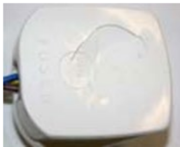
3a Damage to mains plug