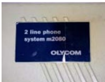
2c Evidence of overheating