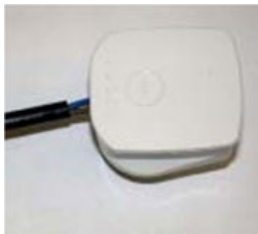
3b Inadequate strain relief