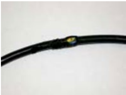
1a Damage to power cable sheath